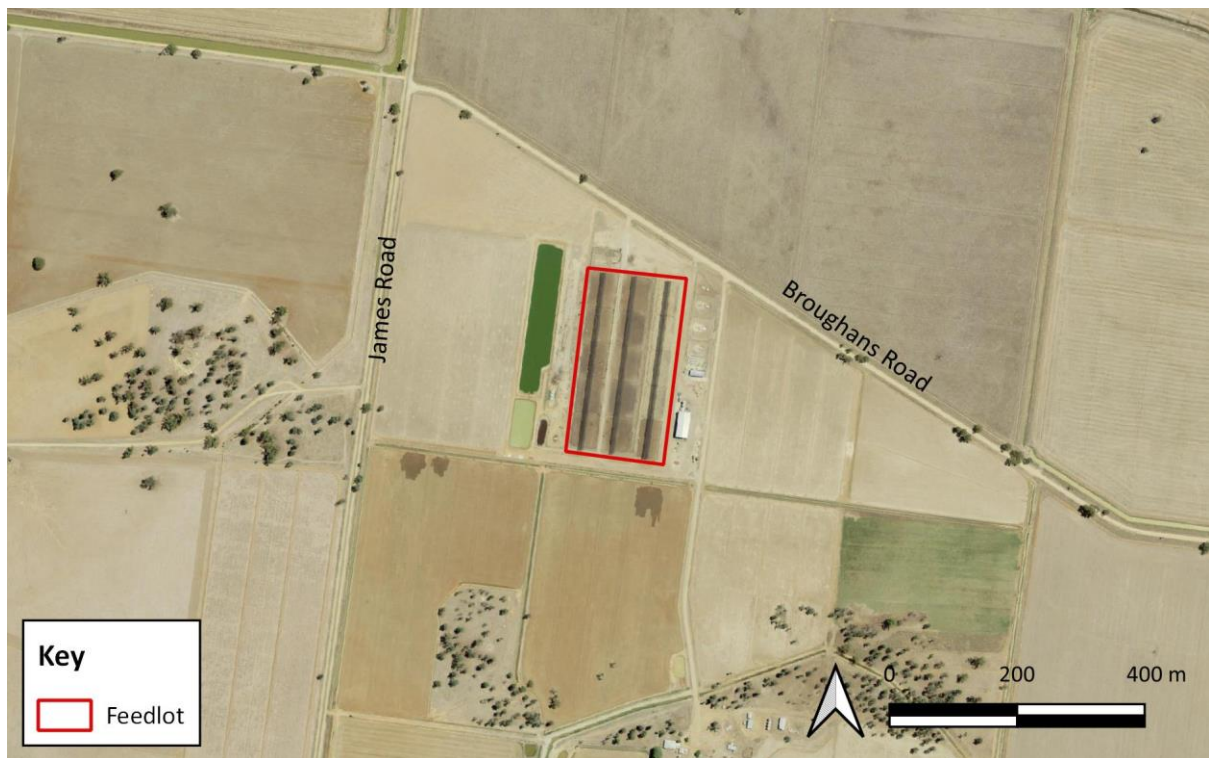
Figure 2 Location of the study area.