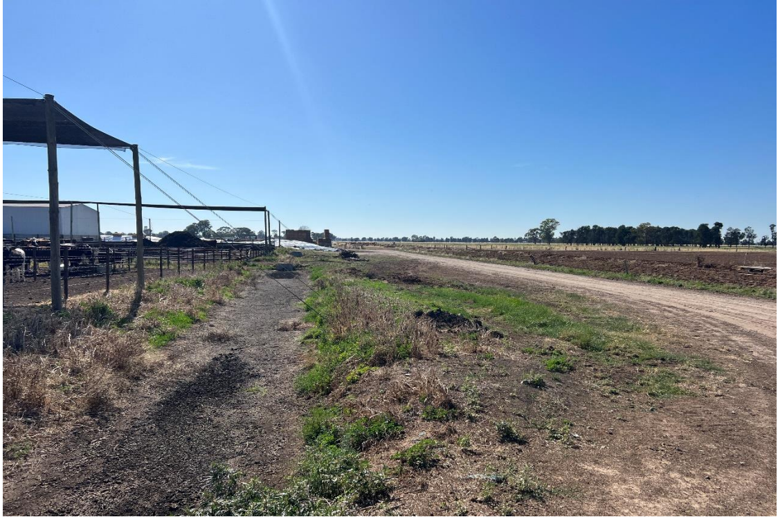
Figure 5 View of the southern extent of the feedlot, facing east. This image highlights the earthworks initially undertaken during the feedlots' construction.