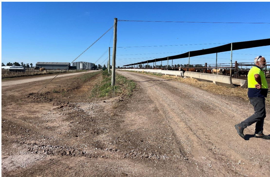
Figure 4 View of the eastern extent of the feedlot, facing south.

During the inspection, the importance of local landforms was discussed. Mr Jones confirmed the most frequent sites in the region are earth mounds, artefacts, and CMTs, and there were no signs to him that increasing the amount of stock within the existing footprint would have an adverse impact on the tangible or intangible heritage values. There were no intangible heritage values identified within the study area.