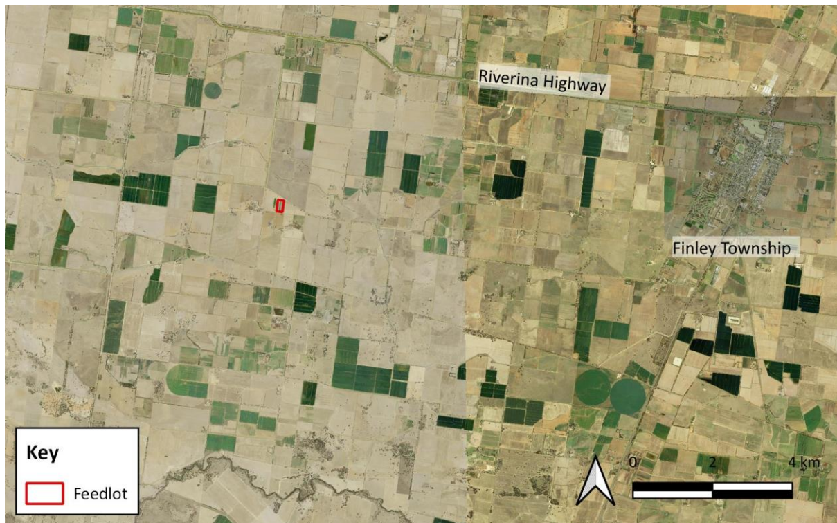
Figure 1 Location of the study area within the region.